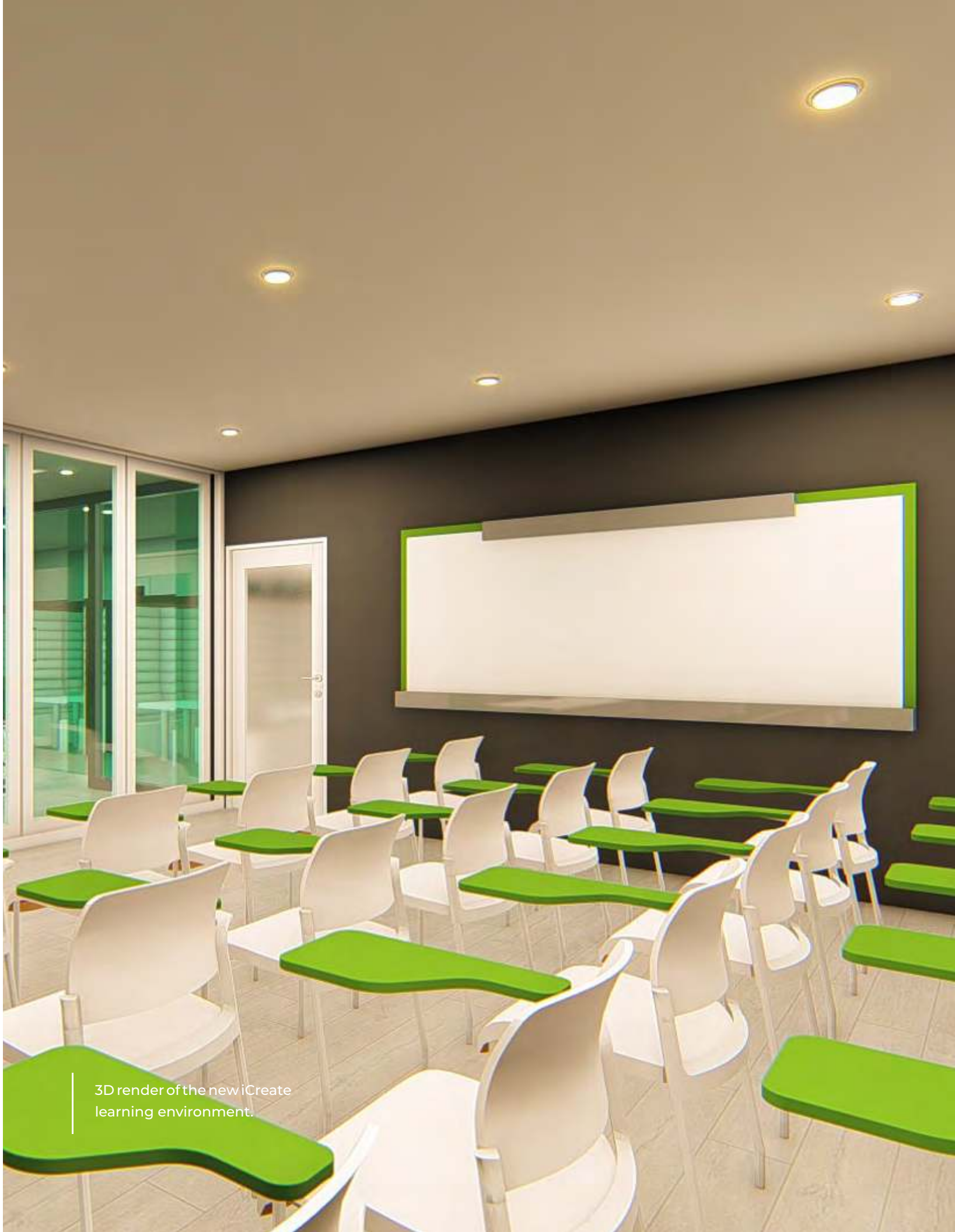
3D render of the new iCreate learning environment.

There have been no changes in accounting policies since the most recent audited financial statements as at December 31, 2019 .