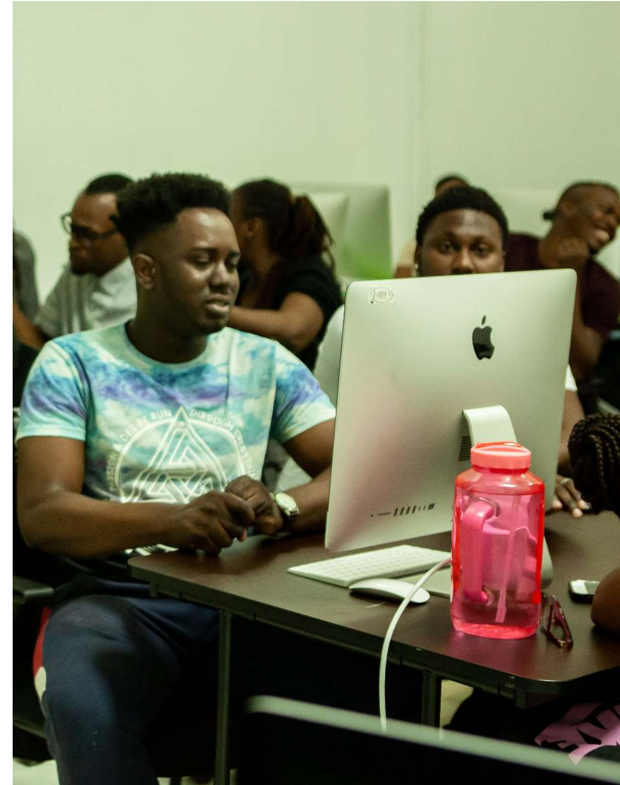
Creatives in Video Production class as part of our partnership with Heart Trust-NTA in Kingston, Jamaica.