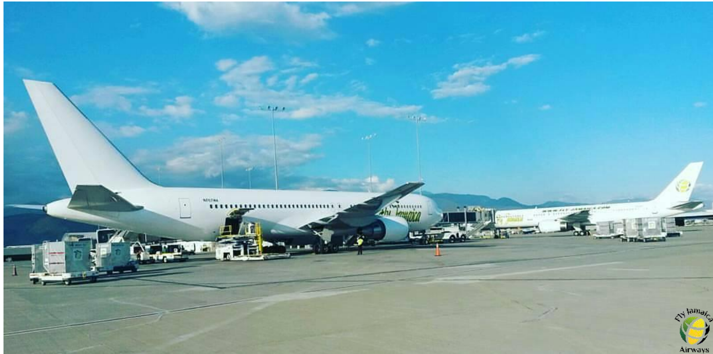
Fly Jamaica Airways' Boeing 767 (left) and Boeing 757 (right) at NMIA, Jamaica.