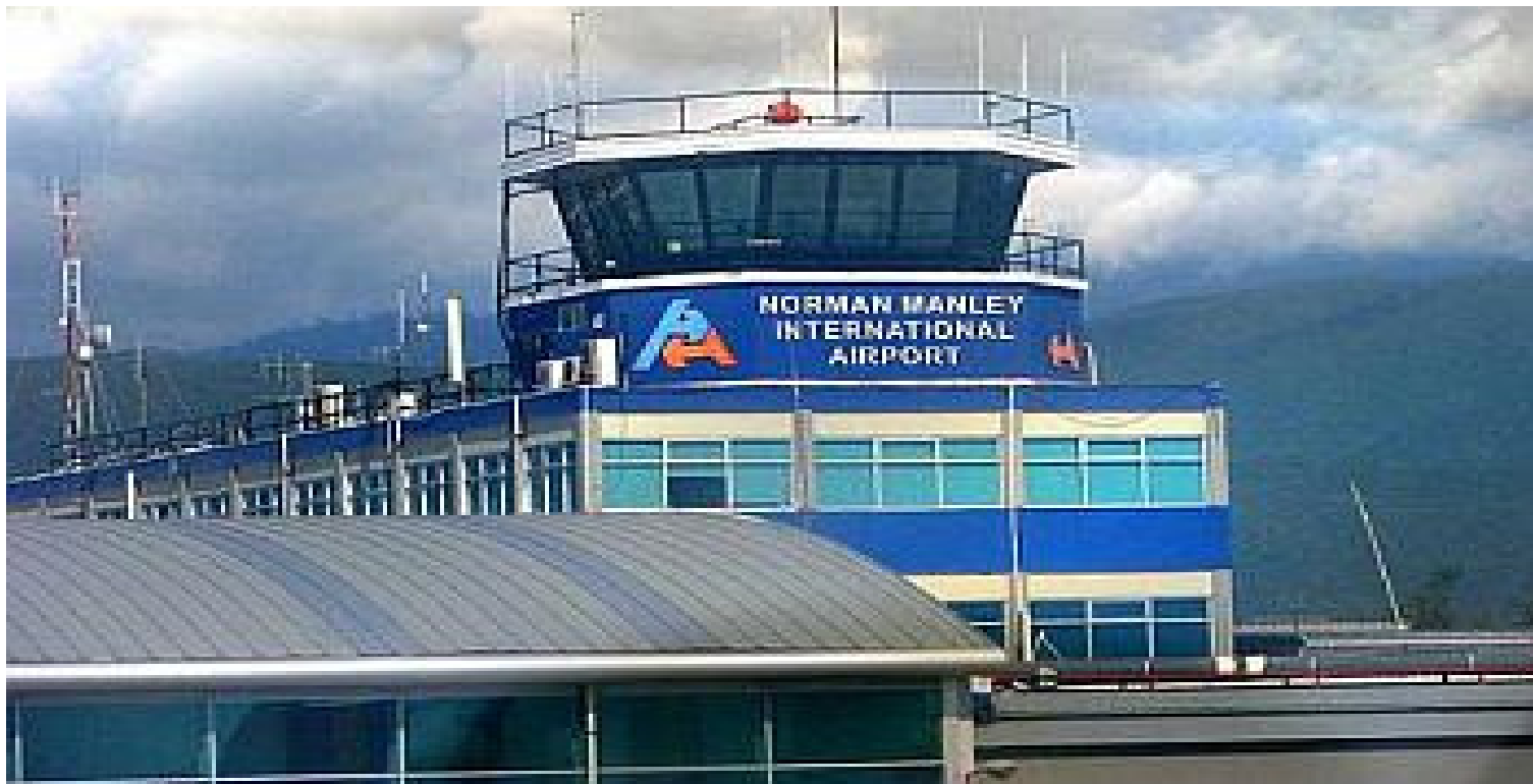
NORMAN MANLEY INTERNATIONAL