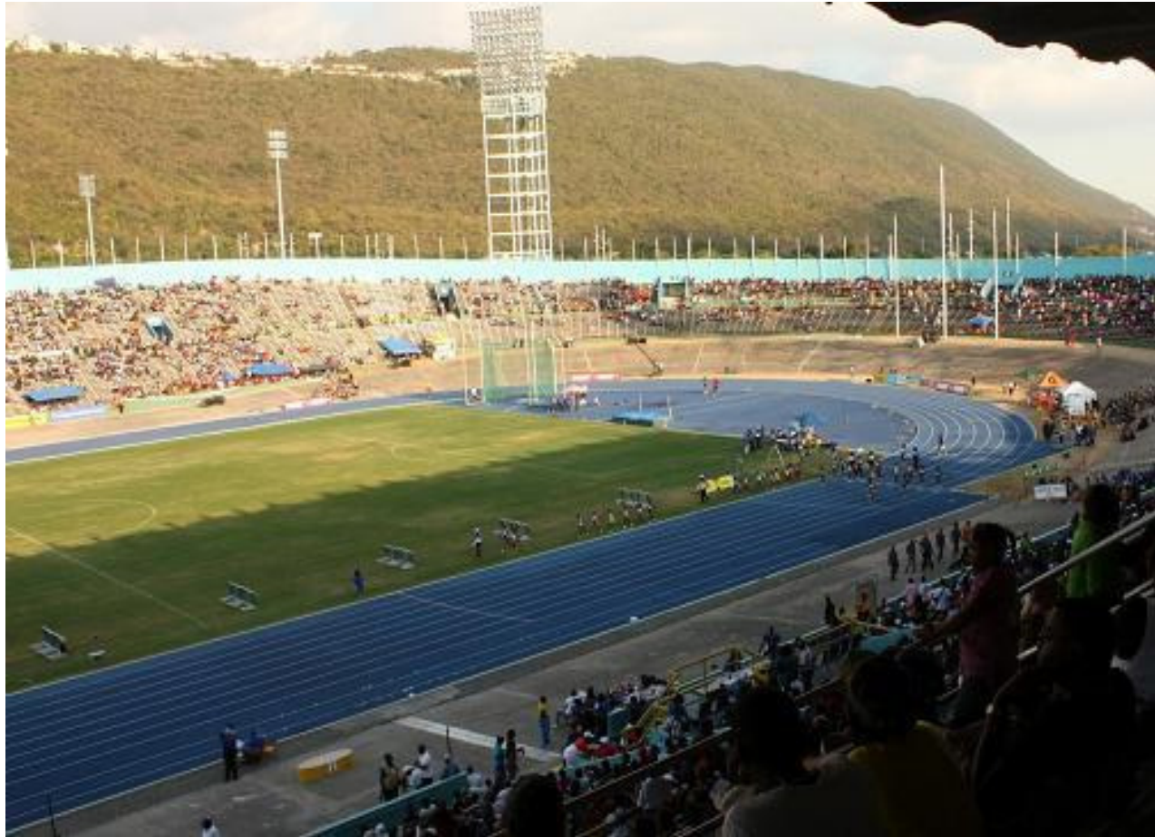
NATIONAL STADIUM - KINGSTON