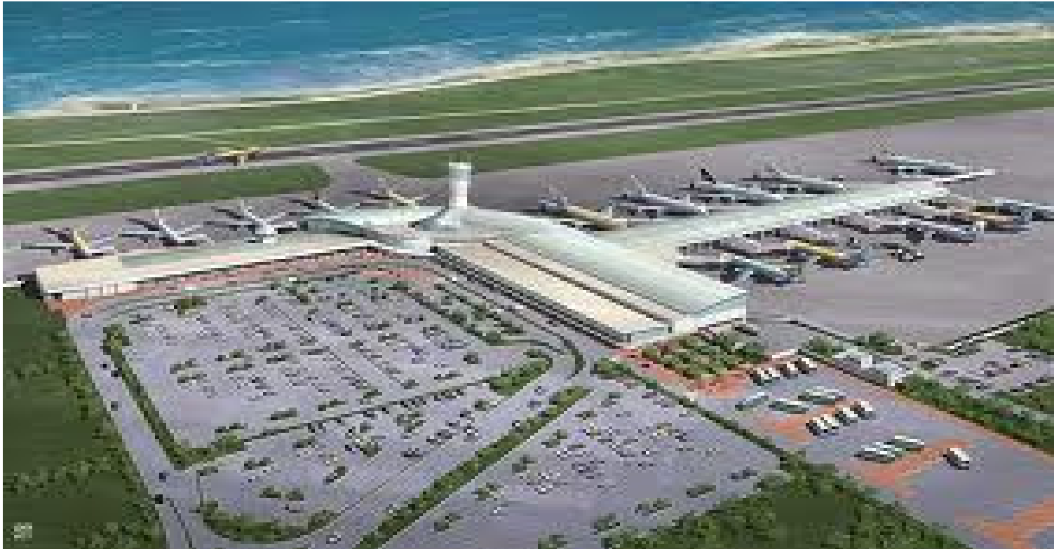
DONALD SANGSTER INTERNATIONAL