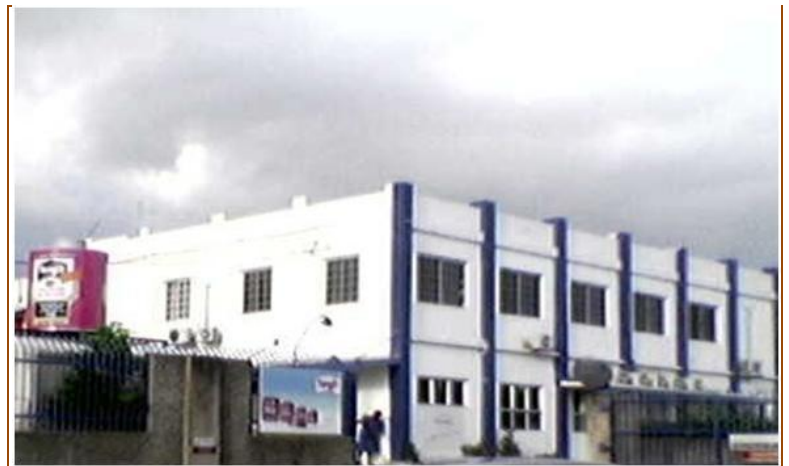
2-story office building/warehouse