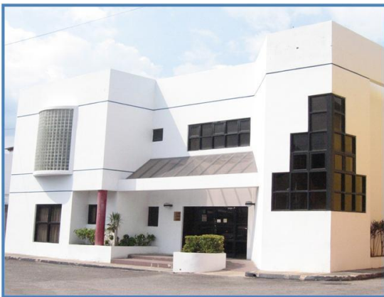
2-story office building (above)

This is to inform the Jamaica Stock Exchange, shareholders and the investing public at large that Kingston Properties is pleased to announce that it has signed a definitive agreement with Henkel Jamaica Limited to purchase the properties located at 36-38 Red Hills Road, near the intersection of Eastwood Park Road and Red Hills Road. The property consists of 47,865 square feet of office and warehouse space across multiple buildings.